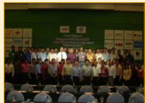
Oct 13-14, 2005: Organized the technical training on "The air-conditioning system design to control the infection and humidity in the hospital" at Radison Hotel, BKK.