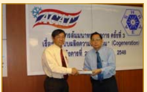
Nov 22, 2005: ASHRAE (THAILAND) organized the technical seminar on "Co-Generation plant" at EIT Seminar Room, BKK.