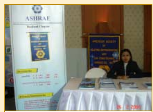
Feb 24, 2006: Joined in "Carrier Journey with the experts" fair by Carries (Thailand) at Maung thong thani, BKK. to promote & PR ASHRAE (THAILAND).